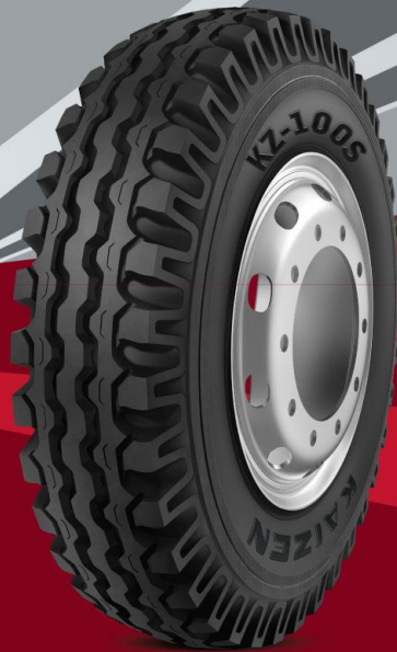
APPLICATION: RATED / NORMAL LOAD TYRE FOR DRIVE AXLE