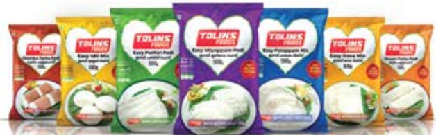
Premium Breakfast Powders

At the core of our multi-faceted success has been our promise to provide the best quality in everything that we undertake. Our latest venture into FMCG products, Tolins Foods, functions on the same philosophy and builds on the legacy of our late founder, who always desired a stronghold in the rice grain industry. Our new generation mined the rich terrain of Kerala to acquire traditional rice mills, spice and rice powder manufacturing plants and equipped them with state-of-the-art technology. The result is our new assortment of premium, unadulterated curry powders, rice powers and rice grains that provide the best value and never compromise on quality. Because we believe in providing products that are aligned to world-class standards, all our products and manufacturing processes are ISO22000 2018, US FDA, Halal, HACCP and FSSAI certified.