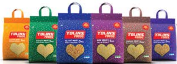
Selected Premium Rice